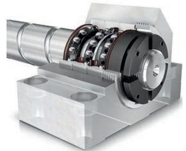
Threaded spindle bearing support with three sealed BSB...-SU-XL bearings

Comparison between BSB...-SU and BSB...-SU-XL shows increase in nominal rating life due to comparatively higher dynamic load ratings