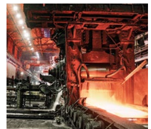
Rolling stands in the steel industry