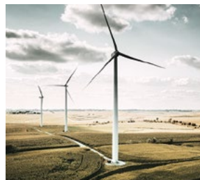
Gearboxes, e.g. in wind turbines