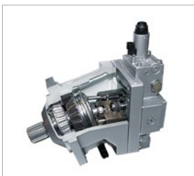
Mobile hydraulic systems