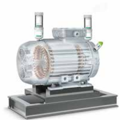
Condition monitoring for electric motors