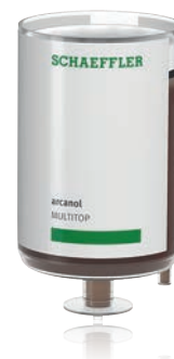
Cartridge with Arcanol