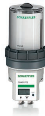
CONCEPT2 with cartridge